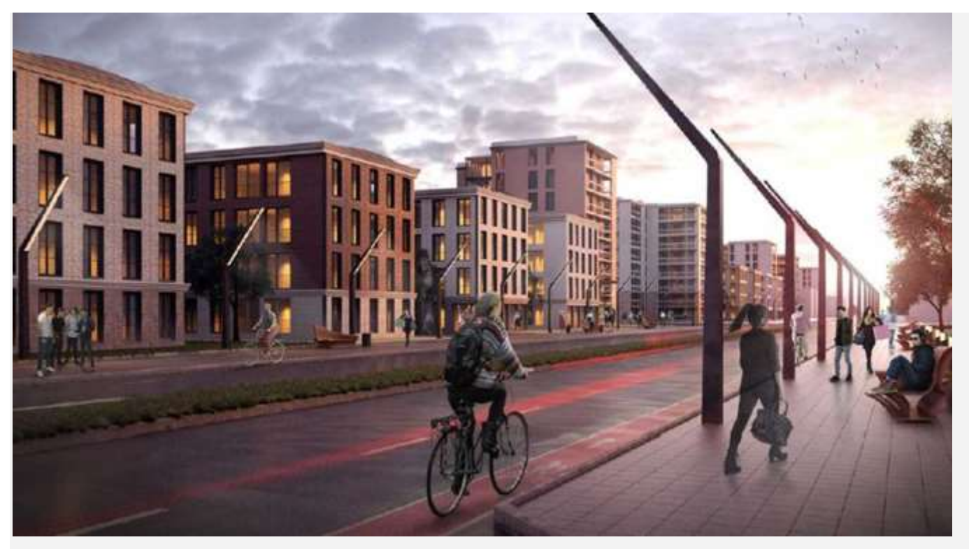
A mixed-use development is planned for 440 acres of lakefront land at 8080 South Lake Shore Drive between 79th Street and the Calumet River in the city's South Chicago neighborhood (Barcelona Housing Systems)

Currently, trees, brush and chained-link fences blanket the land, but the plan includes a series of low-rise apartment buildings, built with environmentally friendly technology, with views of the lake. The new project would be called New South Works.